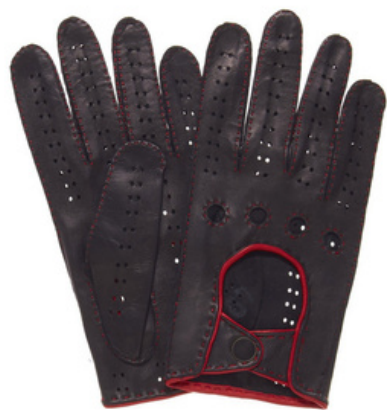
Car Diving Gloves