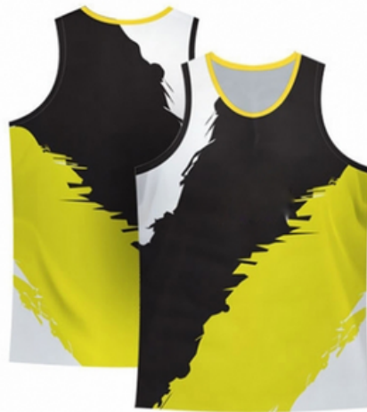
Sublimation Tank Top

100% polyester Sublimation Tank Top L, M, S, XL