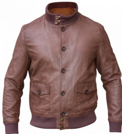
Fashion Jacket For Men

HSI-04-701 BIKER JACKET MADE OF COWHIDE LEATHER S, XL, L, M