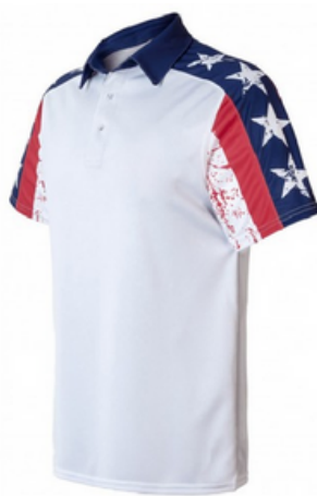
Sublimation Polo Shirt HSI-02-905

Sublimated Polo Shirts Made of Polyester Material:100% Polyester (Dull speedo, Shine speedo, Mini jacquard, Dobby Jacquard etc.) Fabric Weight: 140-160 gsm Sleeves: Short & Long sleeves (B L, M, S, XL