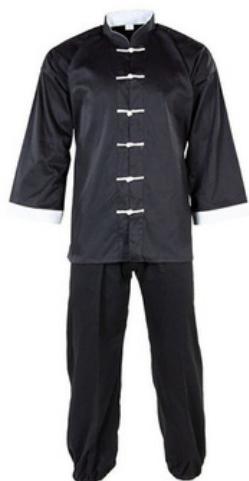
Kung Fu Uniform HSI-03-601

Material: 9oz poly cotton Standard pants ♦ no ankle elastic Sash not included L, S, XL, M