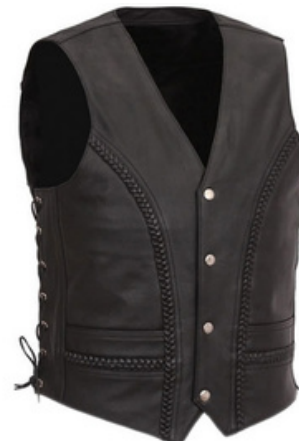
Motorbike Vest For Men HSI-04-403

Men Black Leather Motorcycle Vest with Buffalo Nickel Snaps Soft Milled Cowhide 1.1-1.2mm. Buffalo nickel head snaps on front. outside pockets and two inside pockets for storage. Side Laces for MC look & custom fit. Classic 4 snap front opening. All sizes available. M, L, XL, S