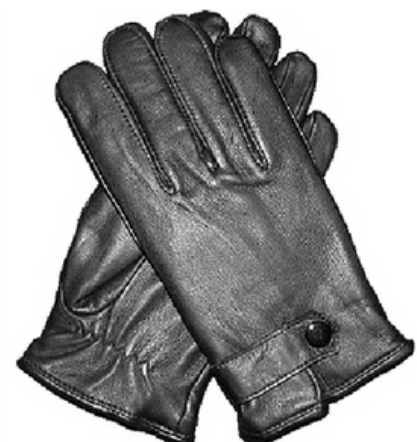
Dressing Gloves HSI-04-1306

Premium Quality Sheep Skin, Lined for Soft Feel & Easy Slip On & Rolled Leather Hem M, L, XL, S