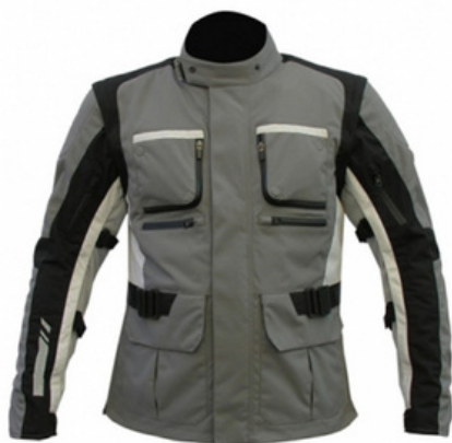
Textile Jacket For Men HSI-04-504

Made of 600 D cordura fabric Removable CE armor Waterproof, full sleeve inner zip out lining, Reflective piping Front zipper closure Adjustable zipper waist M, L, XL, S