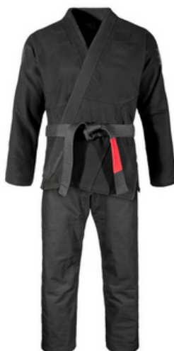
Jiu Jitsu Uniform HSI-03-105

Ultra light Single Weave jacket XL, S, M, L