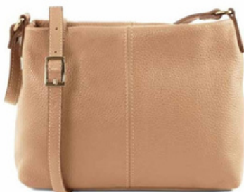
Women Leather Bags

Women Handbags Ladies Handbags Fashion Bag PU Leather Single Girl Fashion Leather Women Hand Bag