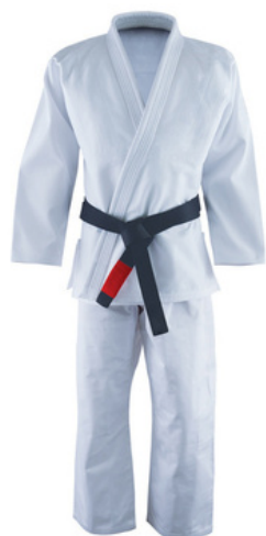
Jiu Jitsu Uniform HSI-03-101

Made of 100% cotton Medium weight single weave rice grain Pre Shrunk. One piece jacket with no back seam. XL, S, M, L