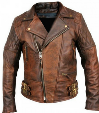
Fashion Jacket For Men

HSI-04-704 BIKER JACKET MADE OF PREMIUM COWHIDE LEATHER M, L, XL, S