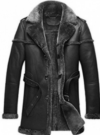
Fashion Blazer For Men

100% Genuine Leather Customizable Biker Long Coat / Jacket for Men S, XL, L, M