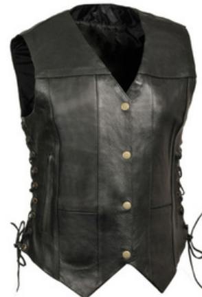
Motorbike Vest For Women HSI-04-406

Women Leather Motorcycle Vest With Side Lace And Concealed Carry Pockets Milled 1.1-1.2mm Cowhide. It is cut longer especially in the front for ladies who do not want the belly to show when they wear a vest.