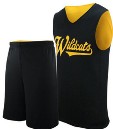
Basketball Uniform HSI-02-201

Custom-made basketball uniform for men 100% Polyester, 160-200gsm. Breathable and quick dry fabric with the function of moisture management and perspiration. Full Sublimation Print L, XL, M, S