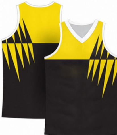
Sublimation Tank Top

100% polyester Sublimation Tank Top XL, S, M, L