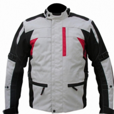
Textile Jacket For Men HSI-04-502

100% Polyester Cordura Removable CE armor Waterproof full sleeve inner zip out lining Zippered vents on front, back and sleeves Front zipper closure Zippered front hand pockets S, XL, L, M