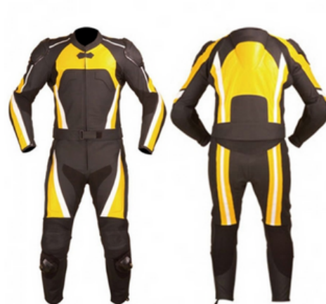
Motorbike Suit HSI-04-103

Leather Motorbike Racing One Piece Suit Made of premier cowhide 1.4MM leather for excellent absorption resistance. Kevlar fabric panels for maximize mobility Stretch leather p M, L, XL, S