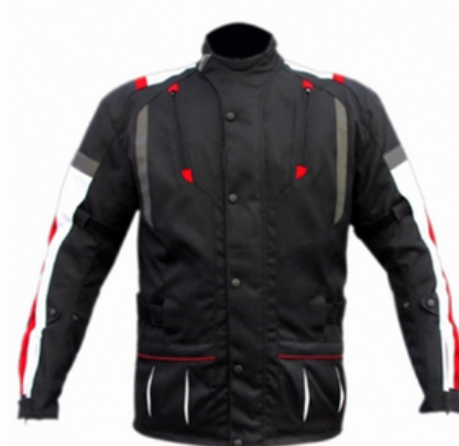
Textile Jacket For Men HSI-04-506

Made of 600 D cordura fabric Removable CE armor Waterproof, full sleeve inner zip out lining Front zipper closure Zippered front hand pockets M, L, XL, S