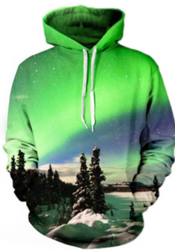
Sublimated Fleece Hoodie

Sublimated Fleece Hoodies Made of Cotton Fleece Material: 100% Cotton Fleece Sleeves: Long sleeves, Sleeveless (As per client demand) Pockets: With 2 Kangaroo pockets on front L, M, S, XL