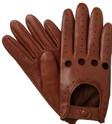
Car Diving Gloves

These best-selling men driving gloves, a constant feature of our website for many years, is the bona fide classic men driving glove; made from soft and supple nappa leather (leather from the hairsheep), classic knuckle vents and perforated fingers to ensure comfort and ventilation and fastened by a golden popper button S, XL, L, M