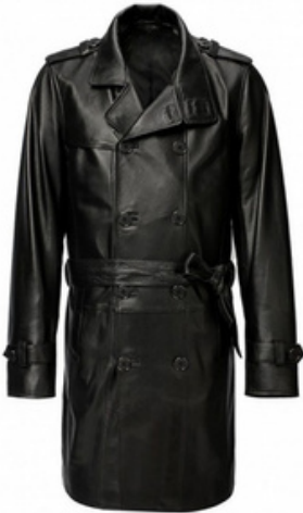
Fashion Blazer For Men