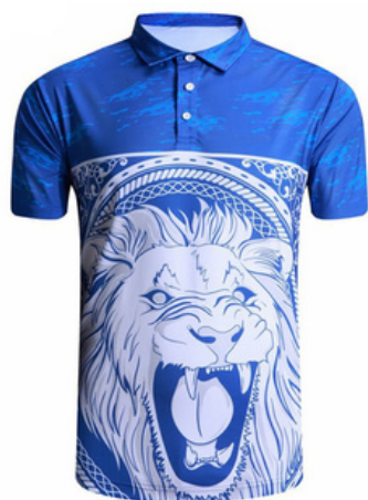
Sublimation Polo Shirt HSI-02-901

Our custom sublimated polo are made with high- quality polyester materials and can feature any design you want. Whether you prefer something fully sublimated or a simple logo, we will work with you XL, S, M, L