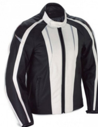
Motorbike Jacket For Women

Women Motorcycle Studded Jacket Made with Premier Leather CE Approved Knox Armour Two Front Pocket With Zip Closer Two Inner Pocket Original YKK Zipper All Sizes Available M, L, XL, S