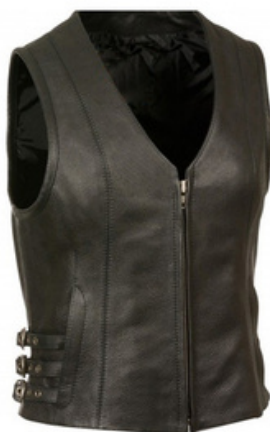
Motorbike Vest For Women HSI-04-404

Men Black Leather Classic Motorcycle Vest with Side Laces & Braided Details Milled 1.1 ♦ 1.2 mm cow leather. Beautiful Leather Braided Detailing. Four shiny silver metal snaps on front. 2 horizontal outside pockets and two inside pockets one zippered and one open welt. Side-lace for MC M, L, XL, S