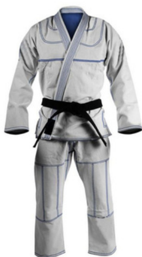
Jiu Jitsu Uniform HSI-03-106

Made of 100% cotton Medium weight single weave rice grain Pre Shrunk. One piece jacket with no back seam. L, M, XL, S