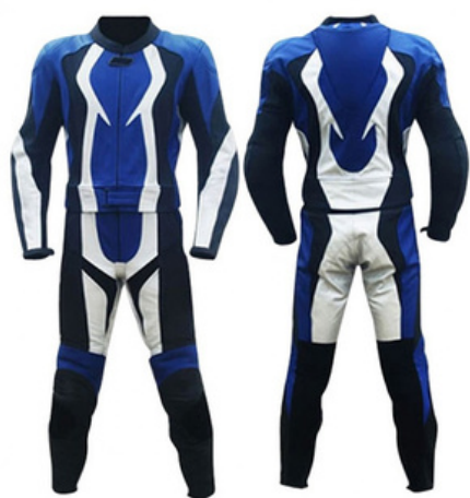
Motorbike Suit HSI-04-101

Leather Motorbike Racing Two Piece Suit Made of premier cowhide 1.4MM leather for excellent absorption resistance. Kevlar fabric panels for maximize mobility Stretch leather panels. S, XL, L, M