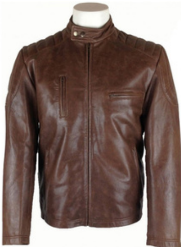
Fashion Blazer For Men

This product from unicorn london is a mens classic blazer Reefer style jacket. Made from Genuine leathercoat.