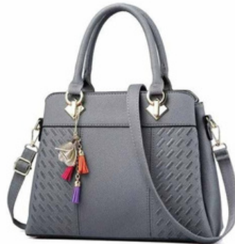
Women Leather Bags

Women Handbags Ladies Handbags Fashion Bag PU Leather Single Girl Fashion Leather Women Hand Bag