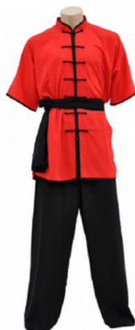
Kung Fu Uniform HSI-03-602

Material: 9oz poly cotton Standard pants ♦ no ankle elastic Sash not included L, S, XL, M