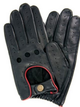
Car Diving Gloves

Drive away in these classic ultra soft stylish and sporty leather driving gloves. Made from nappa leather, acknowledged as the very best gloving leather, in coffee brown and black with contrasting stitching, they will cut a dash behind the wheel. The coffee brown upper side has hand stitched knuckle vents and both side S, XL, L, M