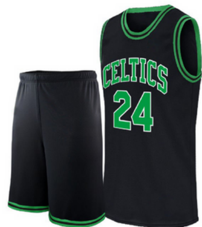
Basketball Uniform HSI-02-206

Custom-made basketball uniform for men 100% Polyester, 160-200gsm. Breathable and quick dry fabric with the function of moisture management and perspiration. Full Sublimation Print L, XL, S, M