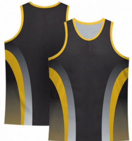
Sublimation Tank Top

100% polyester Sublimation Tank Top XL, S, M, L