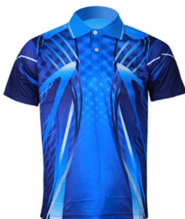
Sublimation Polo Shirt HSI-02-902

Our custom sublimated polo are made with high- quality polyester materials and can feature any design you want. Whether you prefer something fully sublimated or a simple logo, we will work with you XL, S, M, L