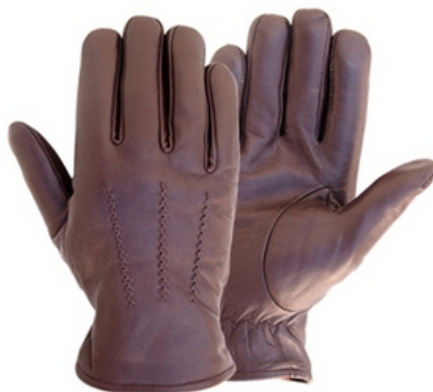
Dressing Gloves HSI-04-1302

Men leather dress gloves with extra long shearling cuff. Featuring stylish contrast stitching and decorative wrist strap. Made of the finest Italian lambskin leather. Lined with 100% pure Italian cashmere S, XL, L, M