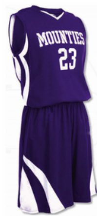
Basketball Uniform HSI-02-207

Custom-made basketball uniform for men 100% Polyester, 160-200gsm. Breathable and quick dry fabric with the function of moisture management and perspiration. Full Sublimation Print M, S, XL, L