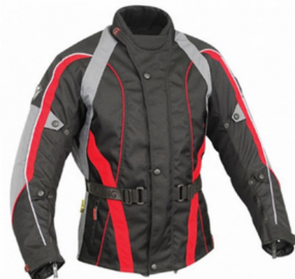
Textile Jacket For Men HSI-04-503

100% Polyester Cordura Removable CE armor Waterproof full sleeve inner zip out lining Zippered vents on front, back and sleeves Front zipper closure Zippered front hand pockets M, L, XL, S