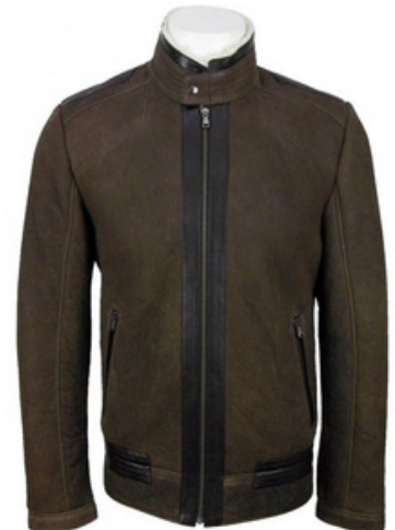
Fashion Blazer For Men

skins of the highest quality in glazed Tan leather .Made from genuine leather skins of the highest quality M, L, XL, Sin brown soft touch leather nappa