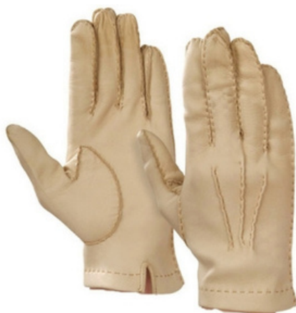
Dressing Gloves HSI-04-1304

Classically styled cashmere-lined leather dress gloves for men. Featuring vent with snap closure at the wrist. Luxurious black fur inside the cuff area. Made of the finest Italian lambskin leather. Lined with 100% pure with a black fur cuff. M, L, XL, S