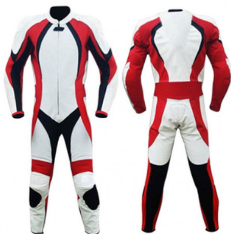
Motorbike Suit HSI-04-104

Leather Motorbike Racing One Piece Suit Made of premier cowhide 1.4MM leather for excellent absorption resistance. Kevlar fabric panels for maximize mobility Stretch leather panels. Polyester m M, L, XL, S