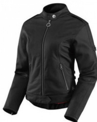
Motorbike Jacket For Women

Women Motorbike Jacket Made with Premier Leather Two Front Pocket With Zip Closer Two Inner Pocket Original YKK Zipper Zip out Lining. All Sizes Available S, XL, L, M