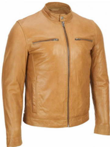
Fashion Jacket For Men

HSI-04-701 BIKER JACKET MADE OF COWHIDE LEATHER S, XL, L, M