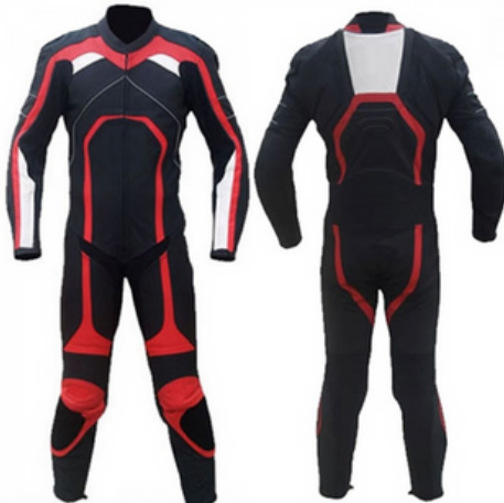
Motorbike Suit HSI-04-102

Leather Motorbike Racing Two Piece Suit Made of premier cowhide 1.4MM leather for excellent absorption resistance. Kevlar fabric panels for maximize mobility Stretch leather panels. S, XL, L, M