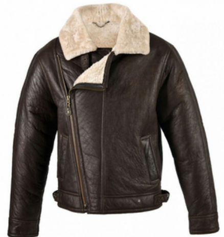
Fashion Jacket For Men

HSI-04-705 DOUBLE RIDER JACKET MADE OF COWHIDE LEATHER M, L, XL, S