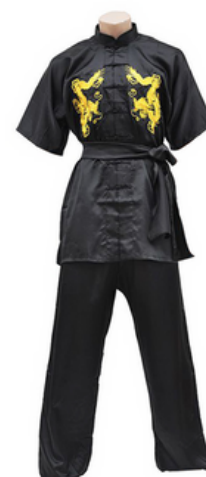
Kung Fu Uniform HSI-03-606

Uniform Includes Kung Fu Jacket and Pants Elastic Waist with Drawstring Tie and Elastic Cuffs at Ankle R L, S, XL, M