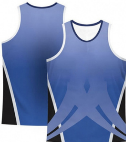
Sublimation Tank Top

100% polyester Sublimation Tank Top XL, S, M, L