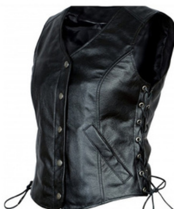
Motorbike Vest For Women HSI-04-405

Ladies Zipper Front Side Buckle Vest w/ V Neck. Premium Cowhide 1.1-1.2mm Zipper Front Design w/ 2 Lower Zipper Pockets Triple Side Set Buckled Detailing Two Zipper Closed Exterior Pockets Built in Dual Side Concealed Weapon & Ammo Pocket M, L, XL, S