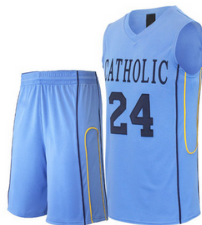
Basketball Uniform HSI-02-204

Custom-made basketball uniform for men 100% Polyester, 160-200gsm. Breathable and quick dry fabric with the function of moisture management and perspiration. Full Sublimation Print L, XL, S, M