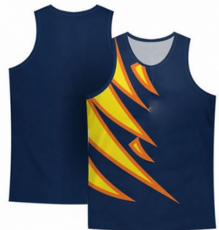
Sublimation Tank Top

100% polyester Sublimation Tank Top XL, S, M, L