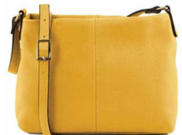
Women Leather Bags

Women Handbags Ladies Handbags Fashion Bag PU Leather Single Girl Fashion Leather Women Hand Bag