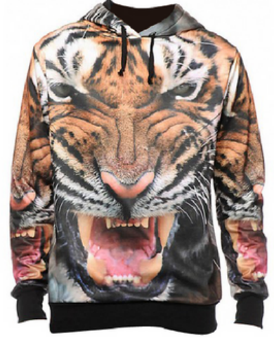
Sublimated Fleece Hoodie

Sublimated Fleece Hoodies Made of Cotton Fleece Material: 100% Cotton Fleece Sleeves: Long sleeves, Sleeveless (As per client demand) Pockets: With 2 Kangaroo pockets on front L, M, S, XL