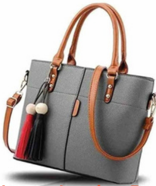
Women Leather Bags