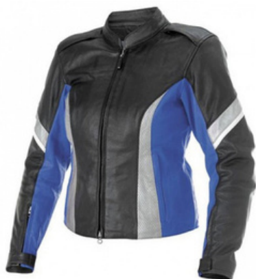
Motorbike Jacket For Women

Motorbike Jacket Made of Premier Leather All size and colors are available. S, XL, L, M