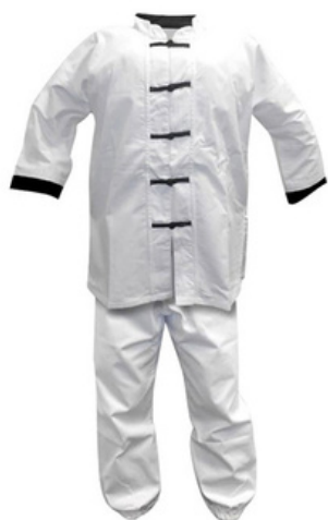
Kung Fu Uniform HSI-03-604

Fabric : viscose (synthetic silk) 65% and cotton 35%. Soft to the touch, pleasant to wear. Light fabric, perfect for summer train L, S, XL, M