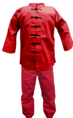
Kung Fu Uniform HSI-03-605

Uniform Includes Kung Fu Jacket and Pants Elastic Waist with Drawstring Tie and Elastic Cuffs at Ankle R M, XL, S, L