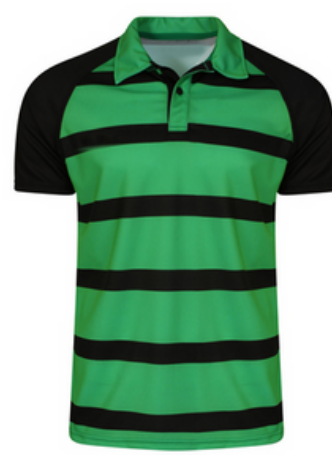
Sublimation Polo Shirt HSI-02-906

Sublimated Polo Shirts Made of Polyester Material:100% Polyester (Dull speedo, Shine speedo, Mini jacquard, Dobby Jacquard etc.) Fabric Weight: 140-160 gsm Sleeves: Short & Long sleeves (B L, M, S, XL