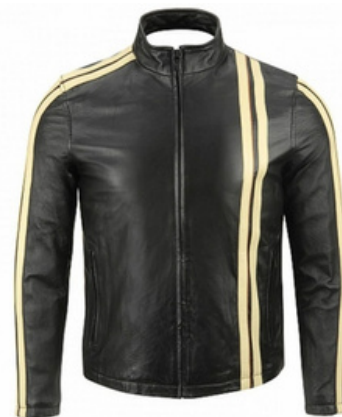
Motorbike Jacket For Men

Leather Motorbike Jacket Made with 1.2-1.3mm Milled Buffalo Hide Leather Complete CE Armour Back, Elbow & Shoulder (Removable) Original YKK Zippers Reflective Material at back and front Kevlar under arms Double stitching waist 2 S, XL, L, M