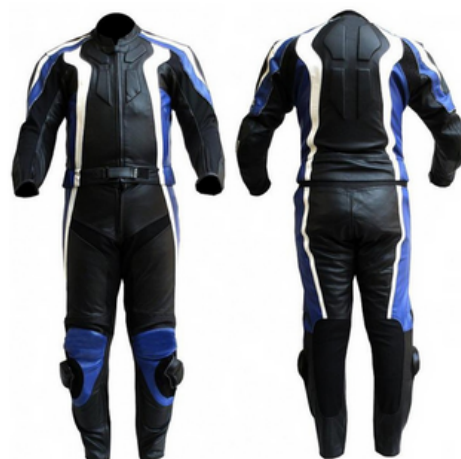
Motorbike Suit HSI-04-106

Leather Motorbike Racing One Piece Suit Made of premier cowhide 1.4MM leather for excellent absorption resistance. Kevlar fabric panels for maximize mobility Stretch leather p M, L, XL, S