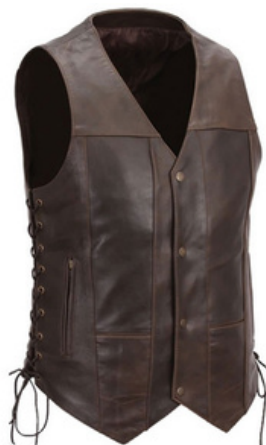
Motorbike Vest For Men HSI-04-401

Men Brown Premium Naked Leather Motorcycle Vest with Gun Concealment Pocket Soft Naked Touch Brown Cowhide 1.2-1.3mm Has inner dual 3 pocket patches and 4 front pockets for ultimate storage possibilities, 10 pockets in total on this vest. Heavy canvas liner on inner pockets for strength and durability S, XL, L, M