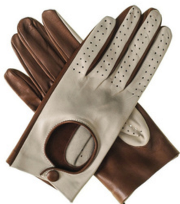
Car Diving Gloves

Stylish, sporty and ultra soft, these two-tone leather driving gloves are made from the softest nappa leather, acknowledged as the finest glove leather. The upper side is in a rich the palm side is a vibrant postbox, red as is the contrast stitching. This classic style has a cut out back and knuckle holes and t S, XL, L, M