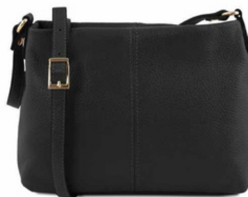
Women Leather Bags

Women Handbags Ladies Handbags Fashion Bag PU Leather Single Girl Fashion Leather Women Hand Bag