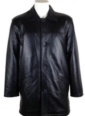
Fashion Blazer For Men

This product from unicorn london is a mens classic coat. Made from genuine leather skins of the highest quality in brown soft touch leather nappa. M, L, XL, S