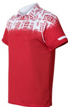
Sublimation Polo Shirt HSI-02-904

Sublimation Polo Shirt is a bold frontal patterning with performance fabric engineering Dry lite fabric engineering Moisture management Soft, stretchable material Bold frontal patterning L, M, S, XL