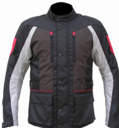
Textile Jacket For Men HSI-04-505

100% Polyester Cordura Removable CE armor Waterproof full sleeve inner zip out lining Zippered vents on front, back and sleeves Front zipper closure Zippered front hand pockets M, L, XL, S