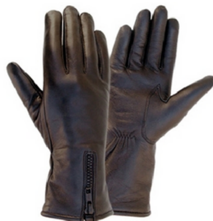
Dressing Gloves HSI-04-1303

Classically styled cashmere-lined leather dress gloves for men. Featuring vent with snap closure at the wrist. Luxurious black fur inside the cuff area. Made of the finest Italian lambskin leather. Lined with 100% pure with a black fur cuff. M, L, XL, S