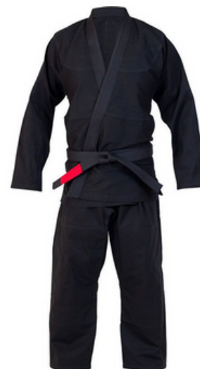
Jiu Jitsu Uniform HSI-03-104

Mid-weight single weave jacket Durable cotton pants Special reinforcements Stiff, thick lapel&ltbr/>M, L, XL, S