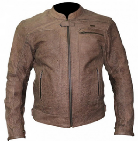
Fashion Jacket For Men

HSI-04-702 BIKER JACKET MADE OF COWHIDE LEATHER M, L, XL, S