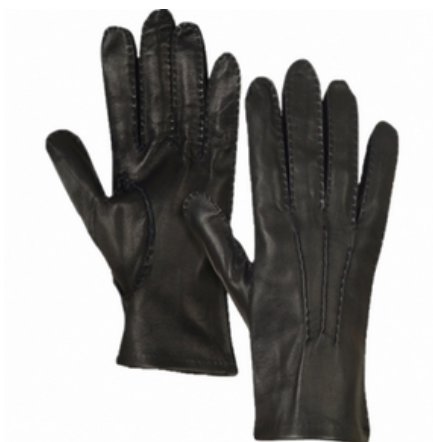
Dressing Gloves HSI-04-1305

Touchscreen capable thumb and index finger. Ideal for Dress or Casual wear. Elastic palm-side wrist snigger Super-soft lambskin leather. Lined with 100% natural wool. M, L, XL, S