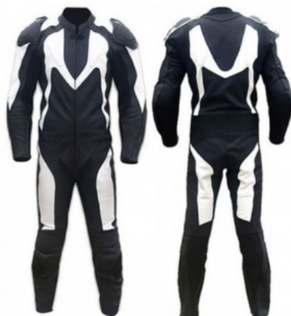
Motorbike Suit HSI-04-105

Leather Motorbike Racing One Piece Suit Made of premier cowhide 1.4MM leather for excellent absorption resistance. Kevlar fabric panels for maximize mobility Stretch leather p M, L, XL, S