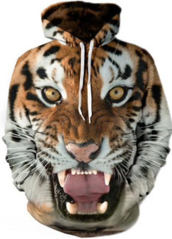
Sublimated Fleece Hoodie