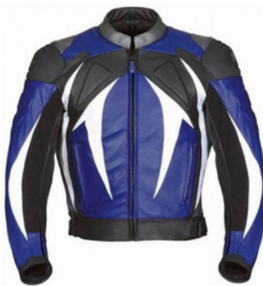
Motorbike Jacket For Men

Motorbike Jacket For Men Made from 1.4mm full grain leather CE approved D3O shoulder and elbow protectors Removable padded thermal lining Snap claws to connect to casual jeans M, L, XL, S