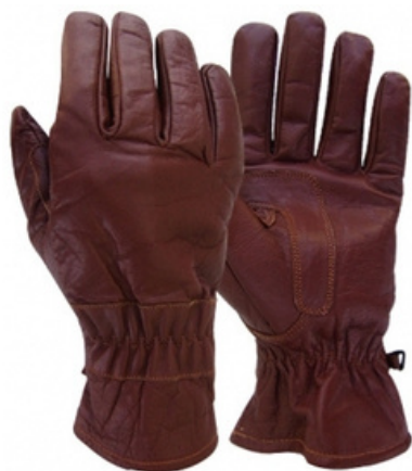
Dressing Gloves HSI-04-1301

Men leather dress gloves with extra long shearling cuff. Featuring stylish contrast stitching and decorative wrist strap. Made of the finest Italian lambskin leather. Lined with 100% pure Italian cashmere S, XL, L, M