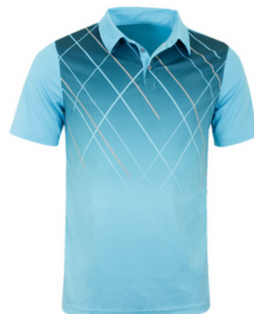
Sublimation Polo Shirt HSI-02-903

Sublimated Polo Shirts Made of Polyester Material:100% Polyester (Dull speedo, Shine speedo, Mini jacquard, Dobby Jacquard etc.) Fabric Weight: 140-160 gsm Sleeves: Short & Long sleeves (B L, M, S, XL