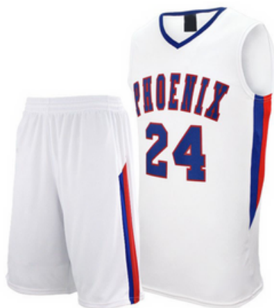
Basketball Uniform HSI-02-202

Custom-made basketball uniform for men 100% Polyester, 160-200gsm. Breathable and quick dry fabric with the function of moisture management and perspiration. Full Sublimation Print L, XL, M, S