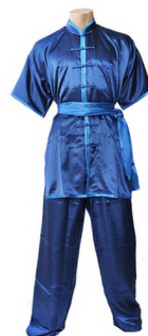
Kung Fu Uniform HSI-03-603

This kind of clothes is large and quite loose, it is intended to practice kung-fu and taichi with complete freedom of movem L, S, XL, M