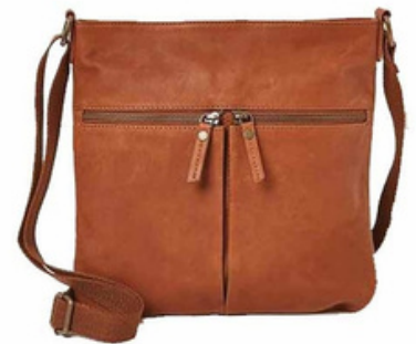
Women Leather Bags

Women Handbags Ladies Handbags Fashion Bag PU Leather Single Girl Fashion Leather Women Hand Bag