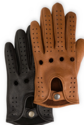
Car Diving Gloves

Our ultimate driving gloves for the connoisseur: Perforated Deerskin with lightweight nappa leather lacing. Very soft, very supple and very desirable. S, XL, L, M