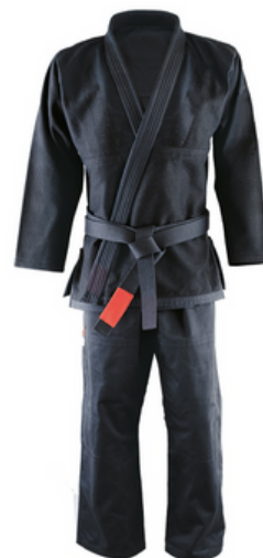
Jiu Jitsu Uniform HSI-03-102

Made of 100% cotton Medium weight single weave rice grain Pre Shrunk. One piece jacket with no back seam. XL, S, M, L