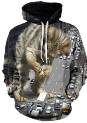
Sublimated Fleece Hoodie

Sublimated Fleece Hoodies Made of Cotton Fleece Material: 100% Cotton Fleece Sleeves: Long sleeves, Sleeveless (As per client demand) Pockets: With 2 Kangaroo pockets on front XL, S, M, L