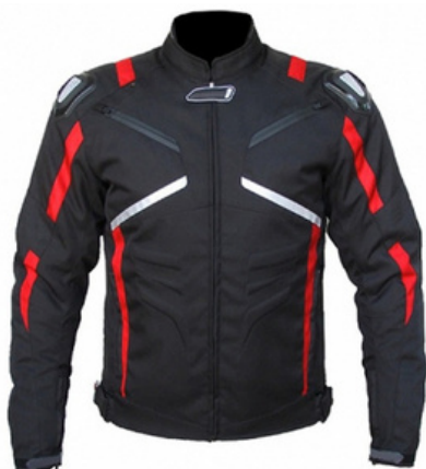
Textile Jacket For Men HSI-04-501

100% Polyester Cordura Removable CE armor Waterproof full sleeve inner zip out lining Zippered vents on front, back and sleeves Front zipper closure Zippered front hand pockets S, XL, L, M