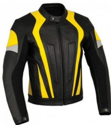
Motorbike Jacket For Men