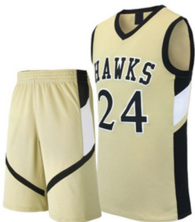
Basketball Uniform HSI-02-205

Custom-made basketball uniform for men 100% Polyester, 160-200gsm. Breathable and quick dry fabric with the function of moisture management and perspiration. Full Sublimation Print M, S, XL, L