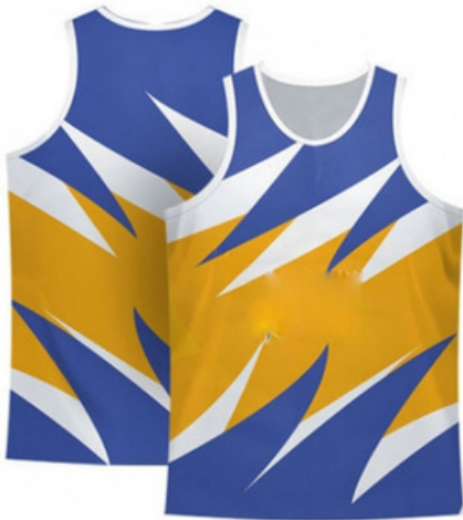
Sublimation Tank Top