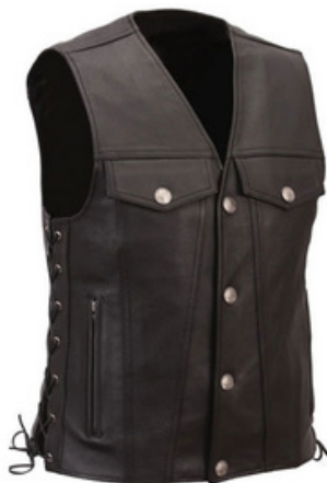
Motorbike Vest For Men HSI-04-402

Men Brown Premium Naked Leather Motorcycle Vest with Gun Concealment Pocket Soft Naked Touch Brown Cowhide 1.2-1.3mm Has inner dual 3 pocket patches and 4 front pockets for ultimate storage possibilities, 10 pockets in total on this vest. Heavy canvas liner on inner pockets for strength and durability S, XL, L, M