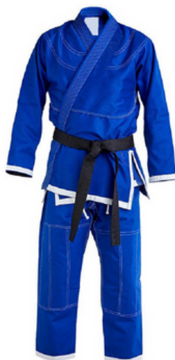
Jiu Jitsu Uniform HSI-03-103

Made of 100% cotton Medium weight single weave rice grain Pre Shrunk. One piece jacket with no back seam. XL, S, M, L