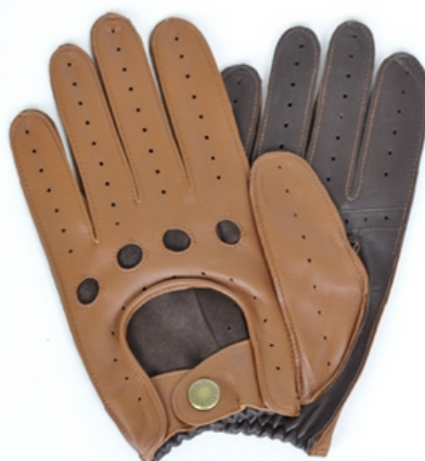
Car Diving Gloves

Remarkably lightweight all-leather driving gloves made in an all-over perforated supple nappa leather. Perfect for the warmer months, these gloves keep your hands cool and dry at the wheel. M, L, XL, S