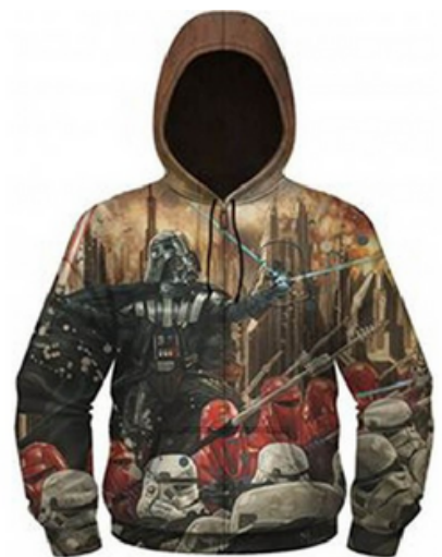
Sublimated Fleece Hoodie

Sublimated Fleece Hoodies Made of Cotton Fleece Material: 100% Cotton Fleece Sleeves: Long sleeves, Sleeveless (As per client demand) Pockets: With 2 Kangaroo pockets on front L, M, S, XL