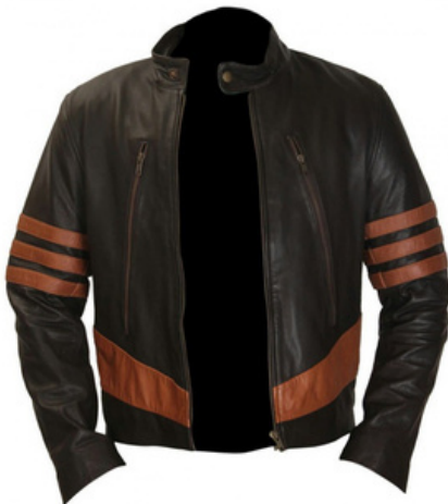
Fashion Jacket For Men

HSI-04-703 RACER JACKET MADE OF BUFFALOHIDE LEATHER M, L, XL, S