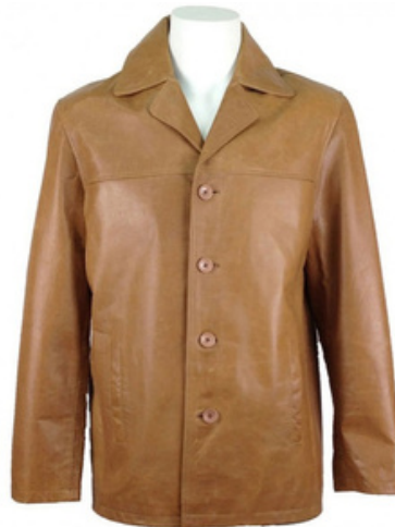
Fashion Blazer For Men

This product from unicorn london is a mens classic coat. Made from genuine leather skins of the highest quality in brown soft touch leather nappa. M, L, XL, S