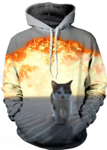
Sublimated Fleece Hoodie

Sublimated Fleece Hoodies Made of Cotton Fleece Material: 100% Cotton Fleece Sleeves: Long sleeves, Sleeveless (As per client demand) Pockets: With 2 Kangaroo pockets on front L, M, S, XL